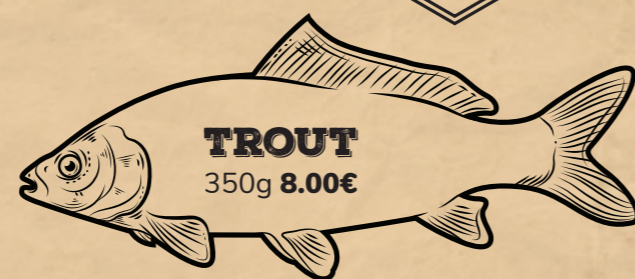
TROUT 350g 8.00€